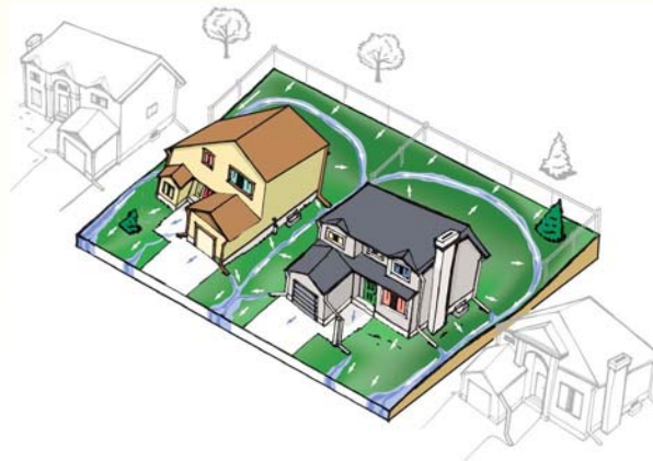
Typical Rear to Front Surface Drainage Design