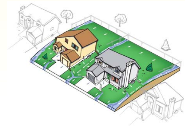
Typical Split Surface Drainage Design